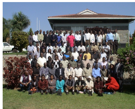
PELUM-Kenya AGM delegates pose for a photo at Bishop Stams Pastoral Center western Kenya. The host Organization

The PELUM-Kenya AGM was held in September 2009 in Western Kenya and hosted by WRCCS. The Company Secretary invited the members. WHERE 92 Participants were present. The first day was basically the discussion on the agendas that had been sent by the Company Secretary. 3 Persons per Organization were invited, the Chief Executive Officer, (C.E.O) A Senior Staff and A Farmer Leader. Besides other Annual General Meeting business, the Members had an opportunity to share sessions about Poultry keeping and Documentation on successive innovation in African Agriculture for Sustainable Development. A field visit was organized where members had an opportunity to visit projects implemented by the Western Region CCS.