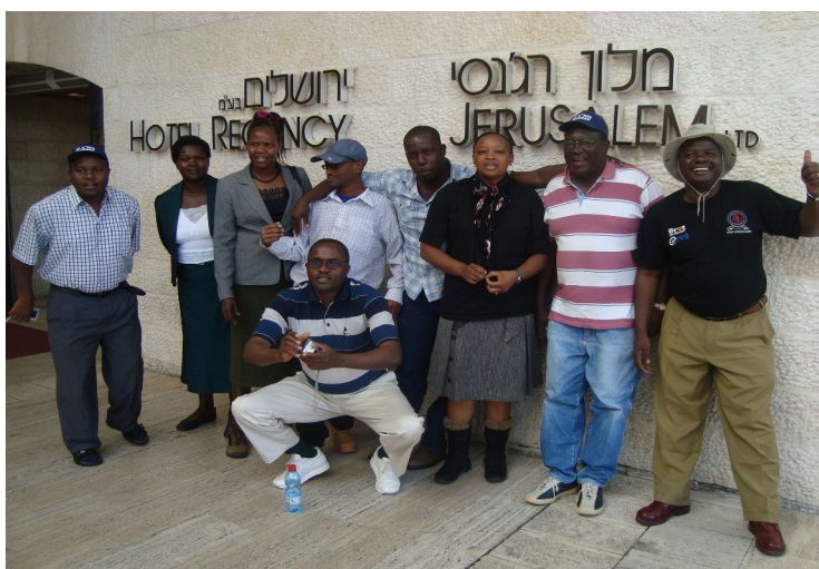
Some of the participants during a visit to Jerusalem