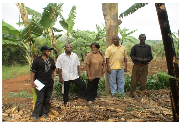
A farmer trained at AMIZERO Training Center talking about banana farming during a field visit. The Bananas are the main source of Income for the Amizero Community Community

The key is to be true to your community's norms and values. You can't just force yourself on people and try to sell them something they don't want. you have to be open-minded when those early opportunities present themselves. Whatever it is that you're successful at, that has to be the No. 1 goal. You have to respect your efforts and the product you create.