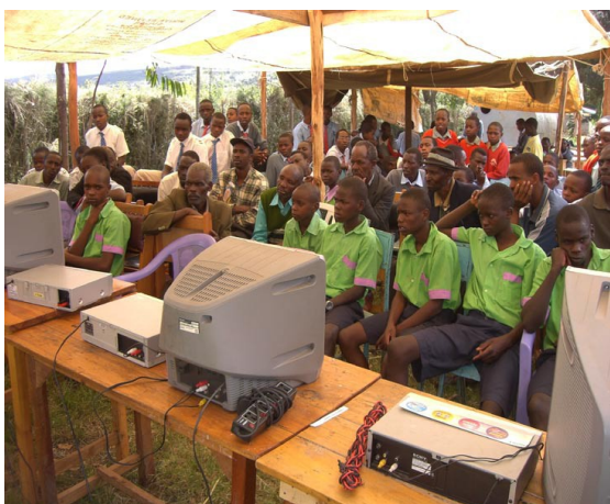
Students, Parents and ALIN Focal Group Members Watch a Water Harvesting CD During the Launch of Ng'arua's Community Knowledge