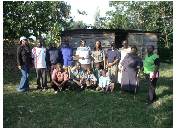
PELUM-Kenya and WRCCS Staff at a farmers homestead during a field visit. to WRCCS Communities

The Organization has Sustainable development projects which also includes promotion of Amaranthus. They have initiated Business Development Plan, Building Local democracy- i.e. building the capacities of the communities in racking development activities.