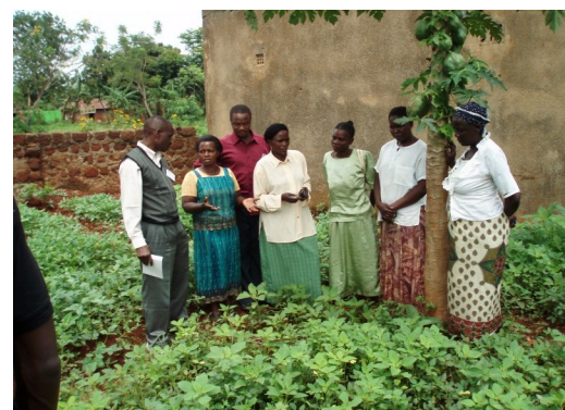
A group consisting of single Women show their farm. The Indigenous vegetables in the background are very nutritious and source of minerals useful for boosting immunity for HIV/AIDS victims.