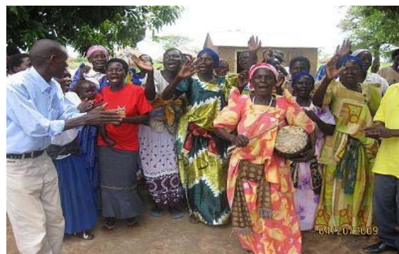
Farmers of Arotomito parish, Uganda rehearsing a song about the ground nut seed

The main target was the extension staff from PELUM-Kenya member organizations, farmer leaders from those organizations and influential religious leader from within the catchment area. The aim of the meeting was to discuss on the process of how to establish GMO free zones among the area of operations of the represented organizations and finally spread out to all PELUM-Kenya other members. The Kenya biosafety act is in place and has some weak areas that require amendments. In the act it's stated clearly that labeling of GMOs products, seeds and derivatives of GMOs is not mandatory. African and Kenya farmers usually plant the seeds stored from previously harvested crops which is preserved using traditional methods. The farmers agreed unanimously that GMOs adoption poses a big threat to the indigenous seeds. Indigenous seeds are our heritage and national treasure it was agreed that it's better to practice ecological agriculture instead of GMOs