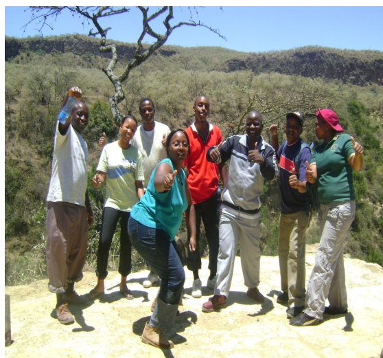
PELUM-Kenya Staff shows their might. With determination there is nothing impossible