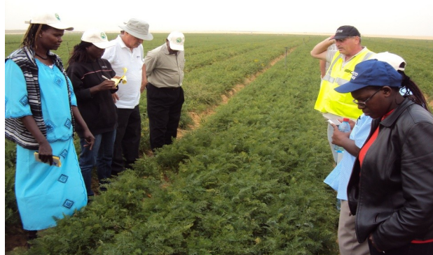
The Participants amazed by the healthy carrots farmed using drip irrigation during a visit in NEGEV desert

21 members from PELUM-Kenya participated in the Organic and Ecofriendly Agriculture Course held from 2 nd to 22 nd March 2010. The Course was held in Israel at MASHAV training Center. The participants were exposed to various techniques, greenhouses, compost making, and drip irrigation among others. This was done in collaboration with Centre for International Agricultural Development Cooperation (CINADCO) of Israel's Ministry of Agriculture and Rural Development which operates as the main professional and operational arm for Israel's development assistance agency of the Ministry of Foreign Affairs, the Centre for International Cooperation .