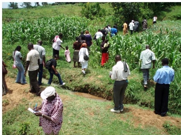
The workshop Participants during a field visit in one of the BERMA Community members

Field visits were organized to BERMA and RODI ( Implementing Partners in Indigenous food Project ) for the participants to be exposed to Indigenous and Traditional foods. The Participants visited 2 Prisons, one of the RODI Prisoners Rehabilitation Programmes (PREP) and later joined the Community members in a food exhibition competition event. 5 community groups participated in the competition. The winner was awarded a trophy and all the groups were issued certificates. In BERMA the participants visited a community group which consisted of single mothers majority of whom are growing indigenous crops and also visited Individual farmers. The participants later participated in an Indigenous food exhibition and competition. The occasion was graced by Senior Government and Local Leaders. The competing groups were awarded gifts, farming equipments and certificates. The Participants had an opportunity to hear and listen stories and testimonies of experiences of Peoples leaving with HIV/AIDS and how the indigenous foods have been of benefit to them.