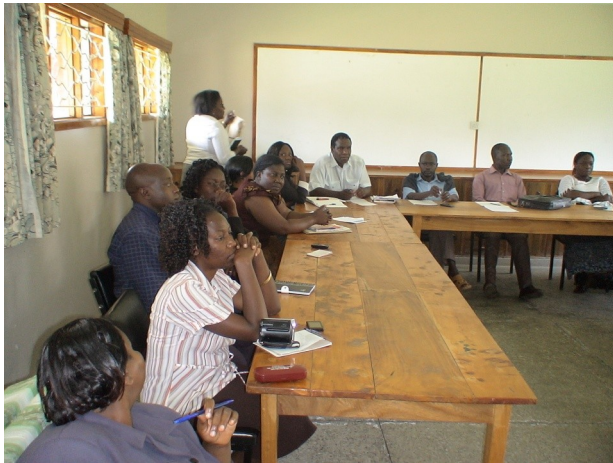
A section of WRCCS Staff during a sharing session with the PELUM-Kenya Staff